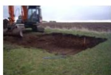
CA034 Briar Rose, Gamrie 019