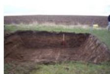
CA034 Briar Rose, Gamrie 015