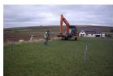
CA034 Briar Rose, Gamrie 004