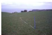
CA034 Briar Rose, Gamrie 002