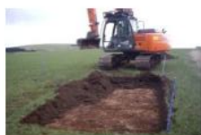
CA034 Briar Rose, Gamrie 009