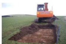
CA034 Briar Rose, Gamrie 008