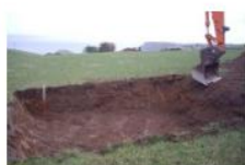
CA034 Briar Rose, Gamrie 014