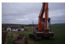
CA034 Briar Rose, Gamrie 003