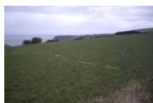
CA034 Briar Rose, Gamrie 001