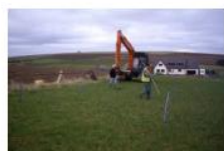
CA034 Briar Rose, Gamrie 005