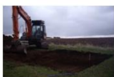
CA034 Briar Rose, Gamrie 017