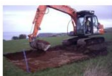
CA034 Briar Rose, Gamrie 012