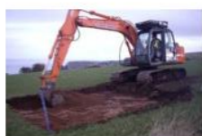
CA034 Briar Rose, Gamrie 011