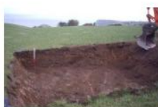
CA034 Briar Rose, Gamrie 013