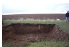
CA034 Briar Rose, Gamrie 016