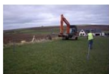
CA034 Briar Rose, Gamrie 006