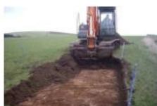
CA034 Briar Rose, Gamrie 007