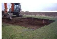
CA034 Briar Rose, Gamrie 018