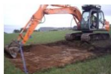
CA034 Briar Rose, Gamrie 010